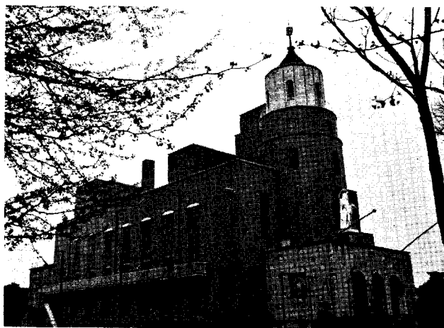
Seichō-No-Ie Tokyo Headquarters