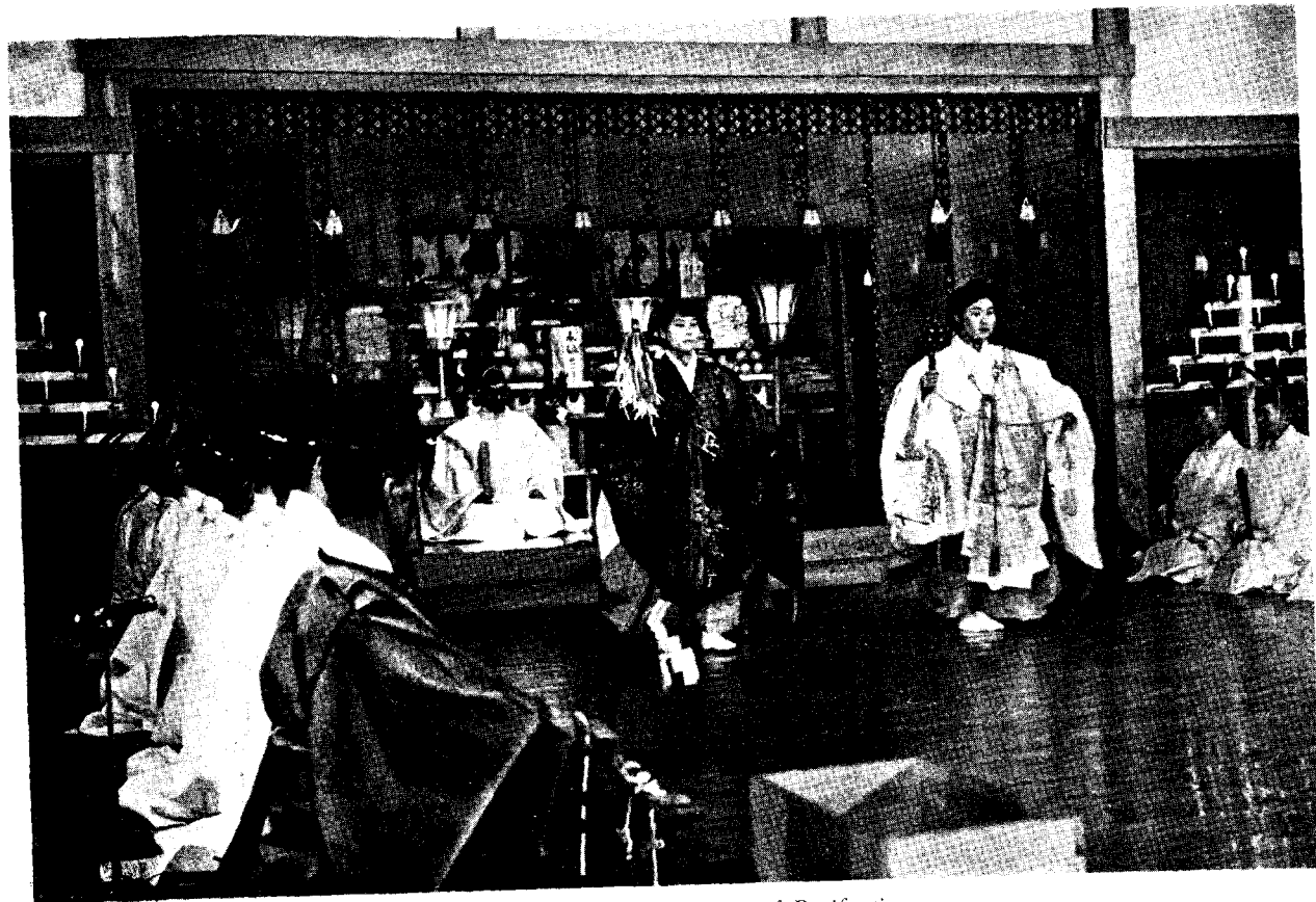
A Sacred Dance (Mikagura) of Purification