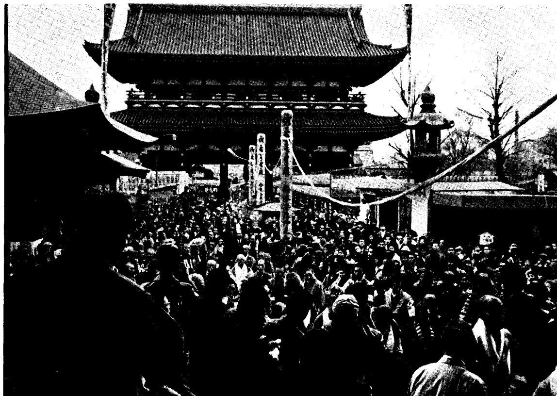
Dedication of New Gate: Hōzōmon April 1, 1964