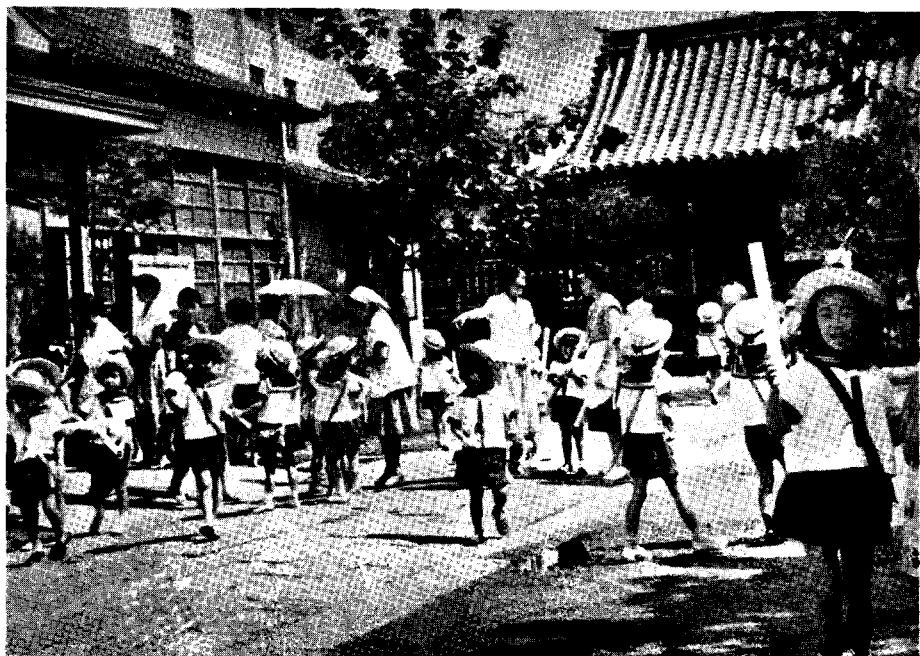
Sensōji Kindergarten in the Temple Compound.