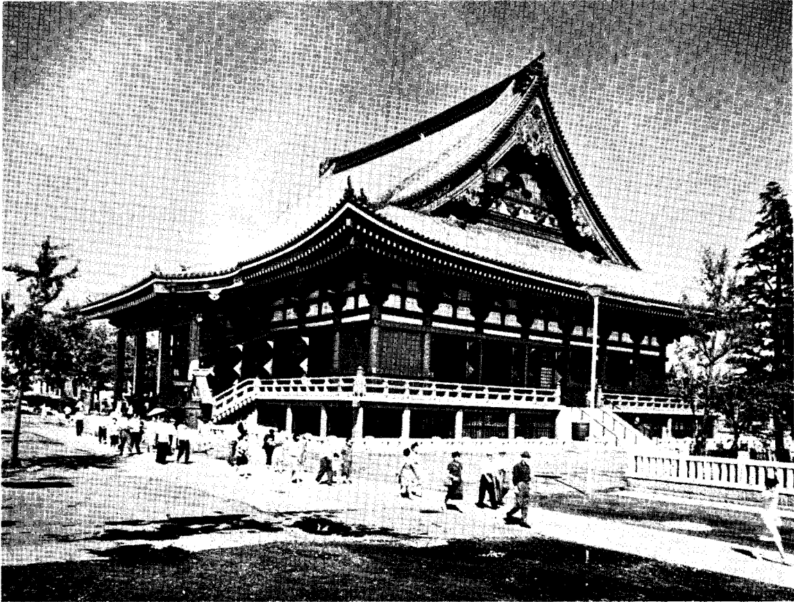
Asakusa Kannon Temple: Sensōji