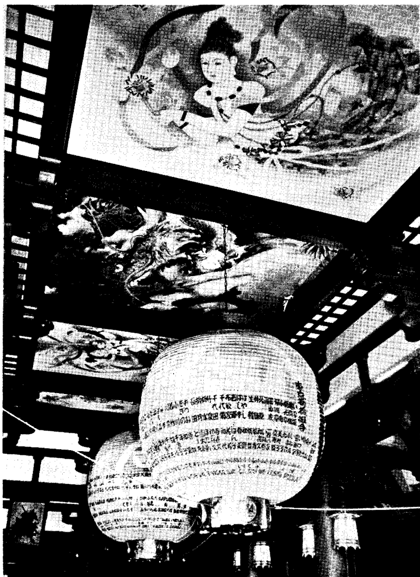
Ceiling pictures of the Main Hall