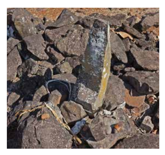
Figure 4: Coral and rope beneath heiau rock

Pa'a also mentioned his concern that women entered the main heiau circle, which was an action specifically prohibited originally (the Department of Land & Natural Resources pamphlet also mentions that women were not allowed in the heiau but could receive training outside the heiau). As Pa'a took me around the site, it was clear that apart from the maintenance of the heiau itself-the grounds were always kept in excellent condition—there is