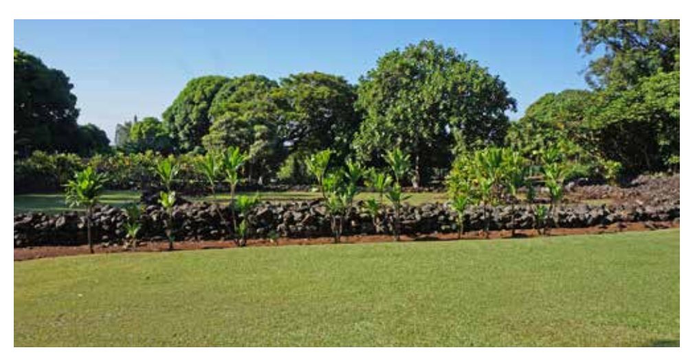
Figure 1. Keaiwa heiau

Based on my observations, while Japanese tourists and the locals appeared to use the site to explore their own spiritual purposes and motivations, there was a degree of uncertainty associated with the site. On the one hand, most visitors from Japan rely on information on Hawaiian power spots from guidebooks, which the locals I interviewed felt contained misleading information. They are also told stories by tour operators that completely miss the original purpose of the site itself. On the other hand, the locals viewed the site of the heiau in ways that reflected differing motivations. One informant was very concerned with cultural heritage, identity, and protocol, another felt it was