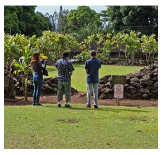
Figure 8: Japanese tourists prepare to enter the heiau

and shared what could be termed "spiritual" information, including topics like the energy of crystals, reiki, and ancestor spirits. They took part in Hawaiian rituals such as Paʿaʾs tattoo tool ceremony within the sacred circle of the heiau and incorporated the healing plants of the heiau in these rituals. For these people, the heiau seemed to serve as a site where social and material exchanges occur that serve to strengthen and possibly valid certain beliefs