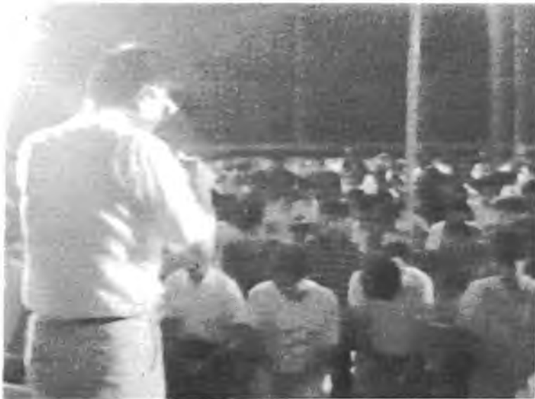
Preparatory lecture about healing