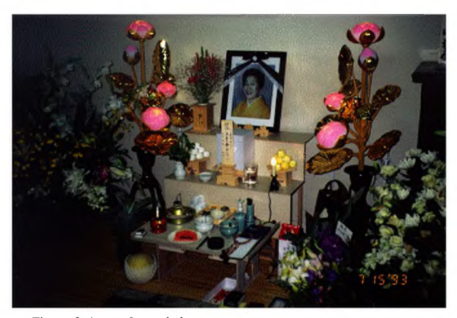
Figure 6. A post-funeral altar.