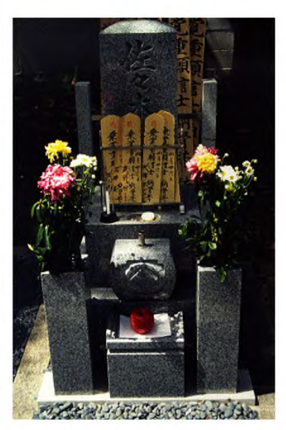
Figure 7. A family grave with offerings.

13. Interment of the bones. Forty-nine days after the death (in practice, the date is flexibly observed), the urn containing the ashes of the deceased