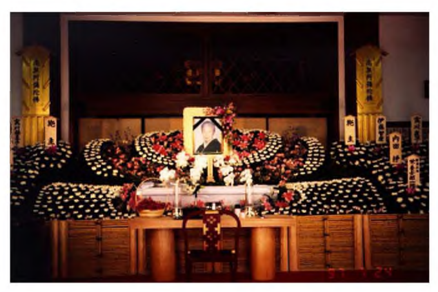
Figure 1. Funeral altar.

5. The wake ( tsuya 通夜). Whether the wake is held at home or in a temple, an elaborate altar is set up by the funeral company (Figure 1). When mourners arrive at the reception table outside the building, they hand over an envelope containing a cash "incense offering" ( kōden 香典) (Figure 2). Meanwhile, one or more priests recite sutras inside. The