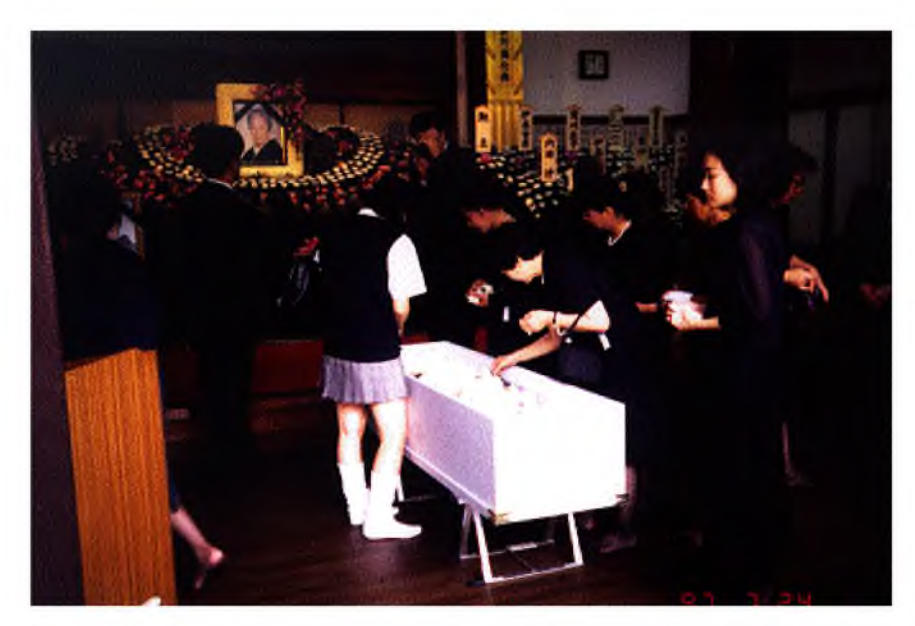
Figure 4. Placing flowers in the coffin.

the coffin around the body of the deceased (Figure 4). A wooden staff (to aid on the post-mortem journey) or items of significance to the deceased (e.g., books, eyeglasses, food) may be placed in the coffin. The coffin is closed and mourners symbolically pound a nail into the coffin using a stone. The coffin is then carried on men's shoulders from the house or temple to the hearse (Figure 5). Finally, the chief