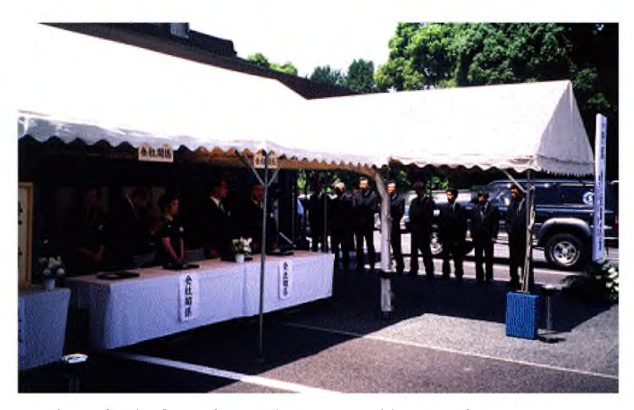
Figure 2. The funeral reception area outside a temple.

5. The wake ( tsuya 通夜). Whether the wake is held at home or in a temple, an elaborate altar is set up by the funeral company (Figure 1). When mourners arrive at the reception table outside the building, they hand over an envelope containing a cash "incense offering" ( kōden 香典) (Figure 2). Meanwhile, one or more priests recite sutras inside. The