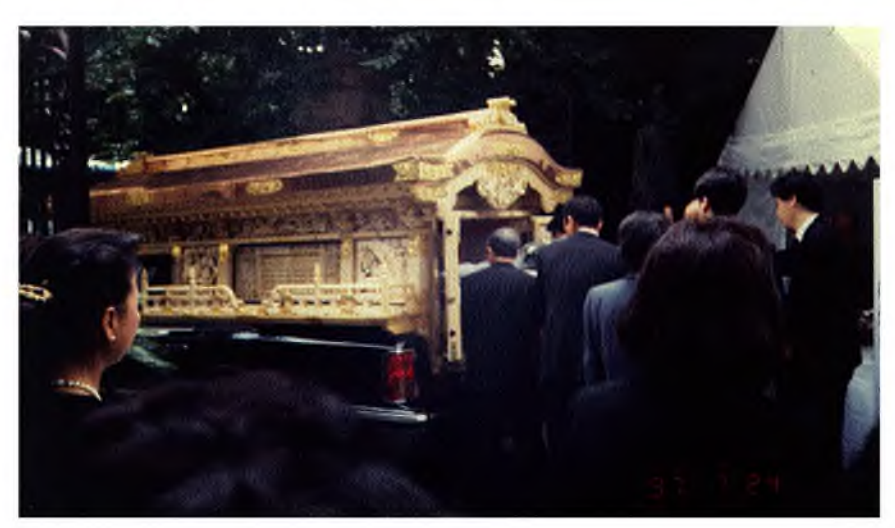
Figure 5. Departure of the hearse.

the coffin around the body of the deceased (Figure 4). A wooden staff (to aid on the post-mortem journey) or items of significance to the deceased (e.g., books, eyeglasses, food) may be placed in the coffin. The coffin is closed and mourners symbolically pound a nail into the coffin using a stone. The coffin is then carried on men's shoulders from the house or temple to the hearse (Figure 5). Finally, the chief