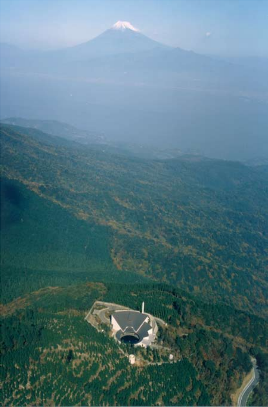
FIGURE 2 Goreisho, Suruga Bay, and Mt. Fuji