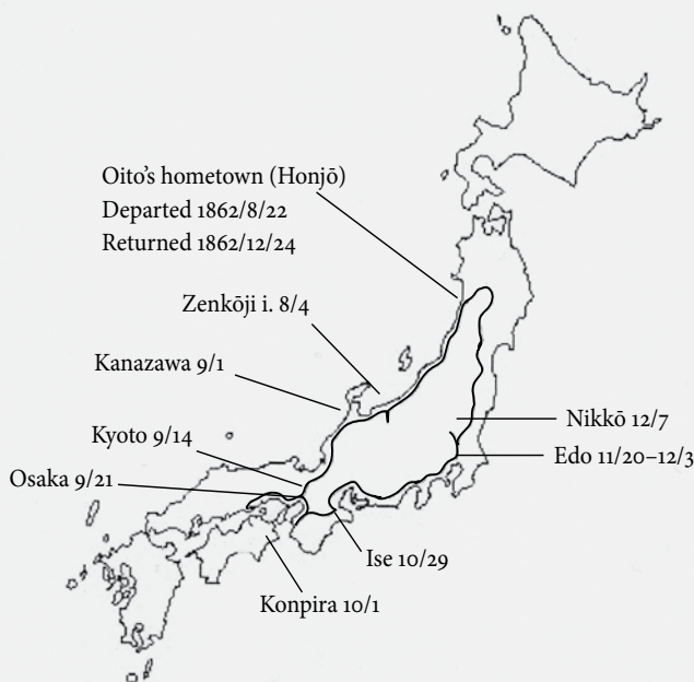
MAP 1: Oito's route, 1862

A woman on the road was, with rare exceptions, out of her element, and would almost always be looked at with a suspicious eye. Village records confirm that the appearance of groups of female travelers had the immediate effect of raising eyebrows among villagers. Between 1729 and 1730, the passage through Toda 戸田 village (in modern-day Shizuoka Prefecture) of a number of female