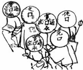
FIGURE 3: Visualizing and lampooning the interconnectedness between faith and money (NSSSS 11 121).

making the rounds up to six times (SHINJŌ 1960, 156). “Professional beggars” and “fake pilgrims” also traveled the route of Shikoku (READER 2005, 123; KOUAMÉ 2001, 145). Comical verses quickly caught on and denounced the scam. The opening lines of a kyōka 狂歌 poked fun at the quest for cash of certain nukemairi pilgrims by declaring “It’s not the bells they shake, it’s the ladle” ( Suzu yori wa shaku furiyuke yo 鈴よりは杓振り行けよ). Another satirical poem, composed after the great mass departure of 1830, simply suggested: