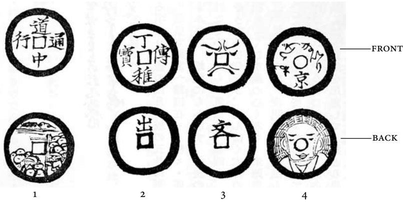
FIGURE 2: Okage money poking fun at runaway pilgrims and at the miserly conditions of many nukemairi escapees (NSSSS 11, 125).