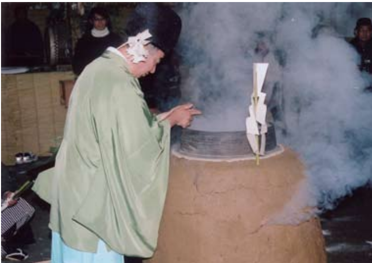
FIGURE 1. The hanadayū performing a kuji before the cauldron. Tsuki, Tōei-chō.

It would be a mistake, however, to think of the hanamatsuri as a festival that was suddenly and dramatically transformed once and for all at the beginning of the modern period, for in fact the hanamatsuri has always been evolving and itself developed out of a larger festival that dates back to the latter part of