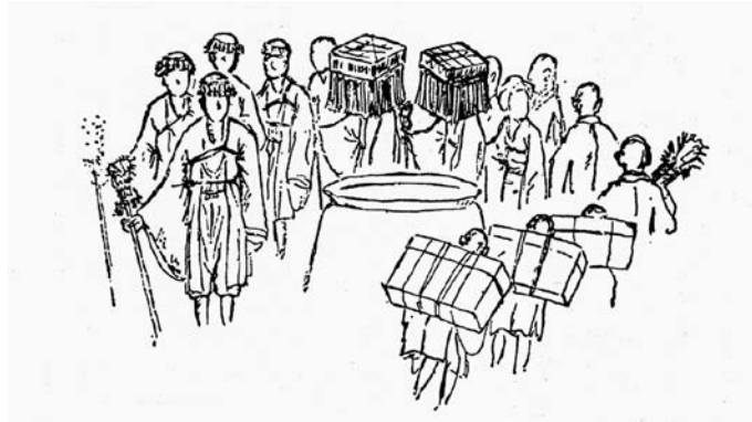
FIGURE 5: HAYAKAWA's illustration of hanasodate ritual (1972, 1: 150). (Courtesy Miraisha).

Indeed, the decline/transformation of the hanasodate can be seen as one of the principal sources of the confusion surrounding the origin and original function of the hanamatsuri , a confusion that extends even to the name of the festival itself. Compounding the misunderstanding has been the immense stature enjoyed by one of the first intellectuals to weigh in on the question in the modern period, the literary critic and folklorist Orikuchi Shinobu. In the epilogue he wrote for Hayakawa's study of the hanamatsuri , Orikuchi put forth the argument that the hana in the name stands for the rice plant and by implication that the major function of the festival was to pray for or celebrate in advance the rice crop of the coming agriculture season (ORIKUCHI 1976, 342–43). 14 This theory draws some credence from the ritual implements used in the hanasodate . The poles to which are attached the flower-like decorations, after all, could be interpreted as representing rice plants. The older saimon accompanying the hanasodate , however, make it abundantly clear that the hana in hanasodate is