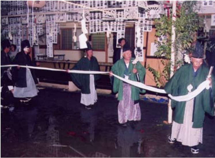
FIGURE 6. Hanasodate , Tsuki, Tōei-chō. (Photo by author).

the Pure Land. The following passage is from the Hanasodate saimon of Komadate and is dated 1702: