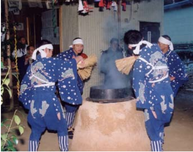
FIGURE 4. Yubayashi , Nakanzeki, Tōei-chō.

than religious: it is an assertion of community spirit and identity as well as an opportunity for individuals to define their position in that community through the discharging of assigned responsibilities. But “community” here means local community, one’s own hamlet. In this sense, the survival of the hanamatsuri represents the prioritizing of the local community over attempts to maintain the more complicated multi-hamlet network necessary for the staging of the longer and more costly ōkagura .