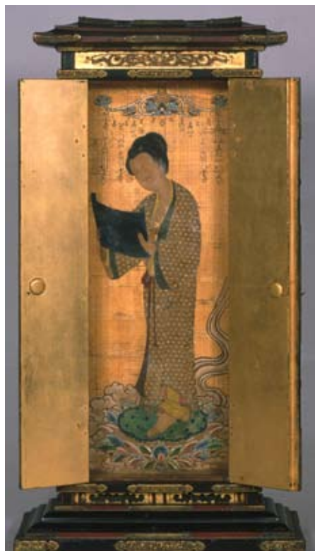
FIGURE 6. Oshie Merōfu Kannon attributed to Tōfukumon'in. Enjuji.