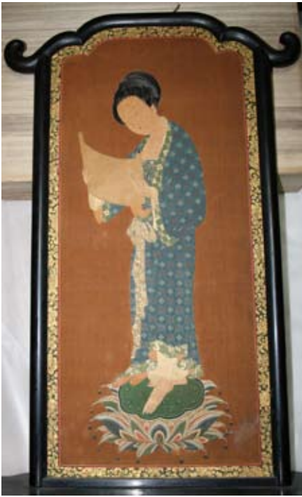
FIGURE 7. Oshie Merōfu Kannon by Tōfukumon'in. Jissōin.

Goyōzei 後陽成 (1571–1617). Sanmi no Tsubone bore three sons, one of whom became abbot of Jissōin. The Jissōin oshie is nearly identical to the images by Tōfukumon'in discussed above, and an examination of old temple records clarified its identity as a Merōfu Kannon from the hand of Empress Tōfukumon'in. 30 It was given to Sanmi no Tsubone by Tōfukumon'in and until the late nineteenth century, was preserved at the temple she founded in Iwakura—Shōkōji 證光寺. (Shōkōji was abandoned during the turmoil at the end of the Edo period, and its images and records were transferred to Jissōin.) The image's "reidentification" as Sanmi no Tsubone was probably the result of fading memories and deaths of informed people, lack of written records, and discontinuation of rituals that maintained the identity of Merōfu. 31