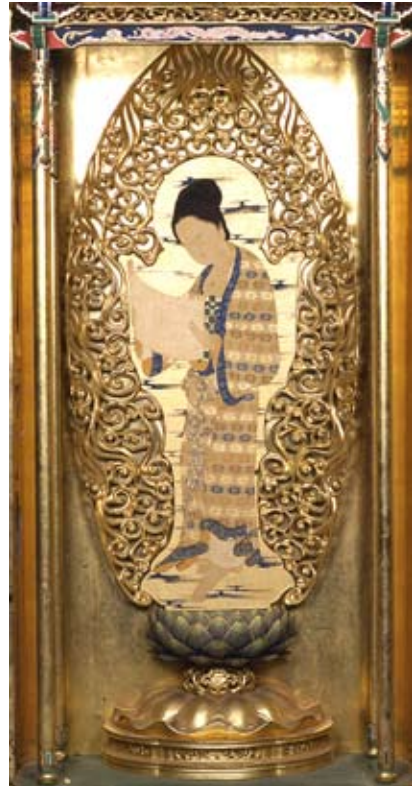
FIGURE 4. Oshie Merōfu Kannon by Tōfukumon'in. Eigenji.

Perhaps the best known of Tōfukumon'in's Merōfu images is the one she presented to Eigenji 永源寺 (FIGURE 4) in Shiga Prefecture. After Isshi Bunshu became abbot of Eigenji in 1643, Tōfukumon'in donated twenty-eight kanme (pounds) of silver for the rebuilding of the Hōjō 方丈 in 1646, ten taels of gold for a memorial service honoring the three hundredth anniversary of its founding in 1655, and thirty taels of gold to purchase a complete set of the Buddhist scriptures ( Daizō-kyō , 大藏經) from China in 1672. 26 According to the document