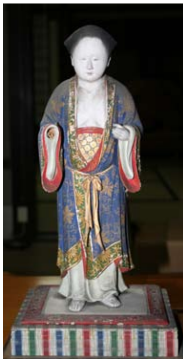
FIGURE 8. Portrait Sculpture of Sanmi no Tsubone. Jissōin.

There is one more oshie Merōfu Kannon image (FIGURE 9), probably modeled after one of Tōfukumon'in's, which was made