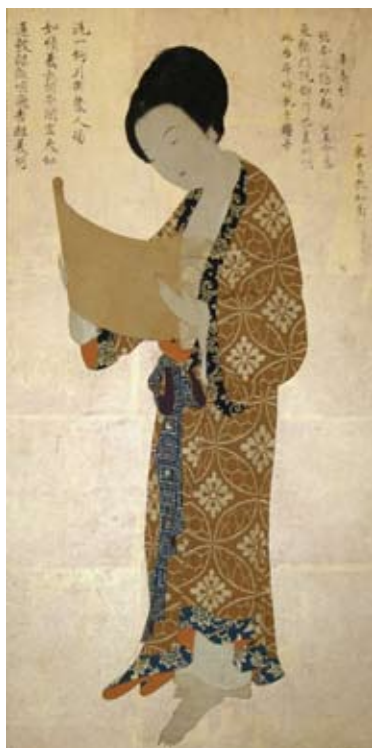
FIGURE 5. Oshie Merōfu Kannon by Tōfukumon'in. Enshōji.

the belt is the same fabric as that in the lower hem of the Eigenji Merōfu Kannon. The head, hands, and feet are of paper, and the scroll held in her hands is made of silk. The hair of Merōfu appears to be black thread, although some of the fringes of the hairline around her face are painted in ink. The figure was mounted on a gold-paper-covered wooden panel, which has a silk border frame. It is housed in a black lacquer shrine with gold leaf ornamenting the inside of the doors.