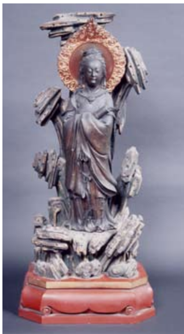
FIGURE 3. Merōfu Kannon Sculpture. Shisendō.

Japanese court women, in particular, found Merōfu an inspiring role model. In addition to being an archetype of female lay practice, she was linked with the Lotus Sutra , which was a favorite of women because of the parables and stories illustrating that females can attain buddhahood. Faith in this deity empowered women, showing them that they could serve as exemplars as well as men. To be compared to Merōfu was a form of praise, because as an attractive, literate laywoman manifestation of Kannon, she was a symbol of wisdom and liberation. For example, an inscription written in 1720 on a chinsō 頂相 painting of Abbess Daiki Songō 大規尊泉 (1674–1719), 23 one of Emperor Gomizuno-o's granddaughters, includes the following line: