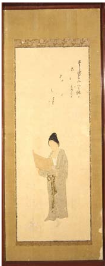
FIGURE 9. Oshie Merōfu Kannon by Shōzan Gen'yō. Shōmyōji.

by Princess Abbess Shōzan Gen'yō 照山元瑤, the eighth daughter of Emperor Gomizuno-o. Her mother was Hōshunmon'in 逢春門院, but she was adopted by Tōfukumon'in at the age of five. Gen'yō was a devout Buddhist from her youth and she never married, receiving the bodhisattva precepts at the age of thirty-two (1665). After her father's death in 1680, she took formal vows and had her resi-