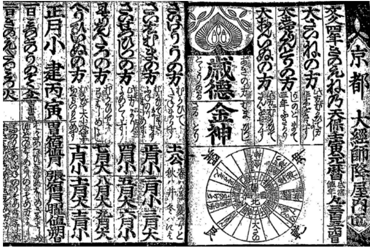
FIGURE 3. Pages from an Edo-period calendar.

rule over fluid and hard-to-control religious practitioners and entertainers, and was able to create social status groups of religious practitioners and entertainers.