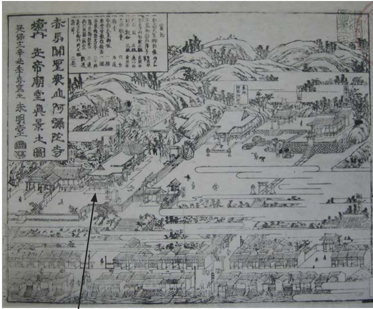
The Spirit Hall