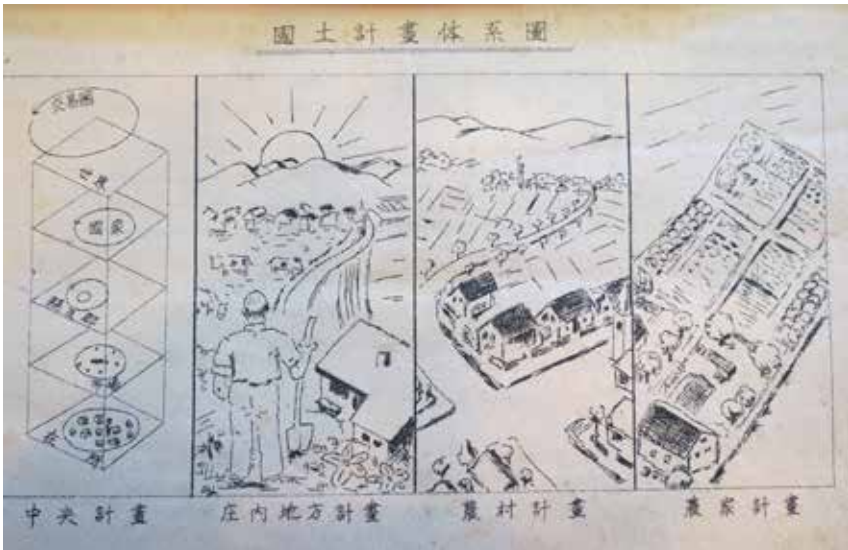
FIGURE 2. Envisioning the reform of the Shōnai region, from right to left: the ideal farmer's house, the farmer's village, the Shōnai region, within the country and the wider world. From Shōnai kokudo keikaku sōan (1943).