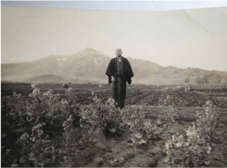
FIGURE 1. Ishiwara Kanji in the fields of the Shōnai plain in Yamagata prefecture.

Ishiwara joined the Kwantung Army's staff in Dairen in 1928, and became one of the planners of the army's takeover of Manchuria in September 1931. His name is therefore still to a large degree identified with the "Manchurian incident." In 1935, he was appointed Chief of Staff of the Operations Division of Army General Staff, and oversaw the draft of the five-year plan for 1937–1941. During the 1937 crisis over the outbreak of war in China, Ishiwara was the key figure of the "non-escalationist" faction in the army, and attempted to stop the conflict, but he was sidelined by the hardliners, who included, among others, Tōjō Hideki 東条英機. Ishiwara continued to criticize Tōjō and oppose the China war, and in response was put on the reserve, and eventually forced to leave the army. It was under the circumstances of the impasse of the war in China that the East Asia League was formed. After lecturing for a while at Ritsumeikan University, Ishiwara returned to his home province of Yamagata, from where he remained active in the East Asia League Movement.