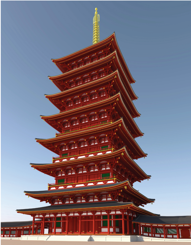
FIGURE 2. Computer-generated reconstruction of the Shōkokuji Pagoda by Tomishima Yoshiyuki and Takegawa Kōhei 竹川浩平.

The recent completion of a computer-generated model of the pagoda makes possible, for the first time, a visualization of the tower in all its astonishing grandeur (FIGURE 2).