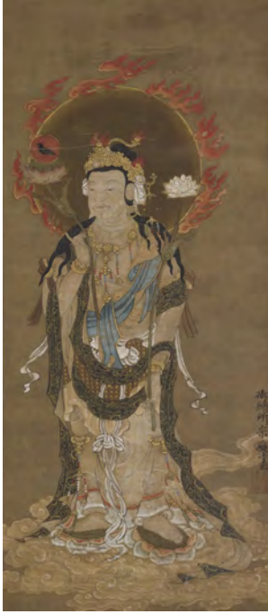
FIGURE 2a. Nitten. Kanda Sōtei Yoshinobu (1656–1728). Edo period. Ink, colors, and gold on silk. Inv. no. B_28029.