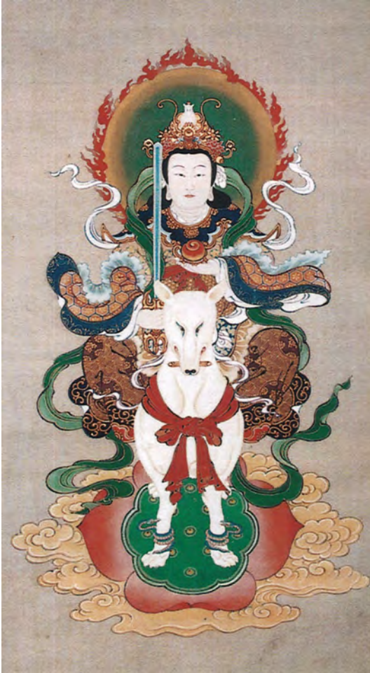
FIGURE 3. Inari Daimyōjin. Kanda Sōtei Yoshinobu (1656–1728). Edo period. Ink, colors, and gold on silk. Sensōji Collection, Tokyo.

The style that characterized the painting of the Kanda atelier was rich in detail, with abundant use of gold paint ( kindei 金泥). The identified scrolls in particular, such as the Nitten scroll mentioned above or examples in Japanese collections such as the Tokyo National Museum and the Kinryūsan Sensōji Temple Collection (FIGURE 3), all bear the hallmarks of steady brushstrokes and exceptional attention to detail with emphasis on a central, frontal composition using a high degree of symmetry. 13 An increasing tendency toward stylization can be witnessed in the latter half of the Edo period. The painted brocade mounting