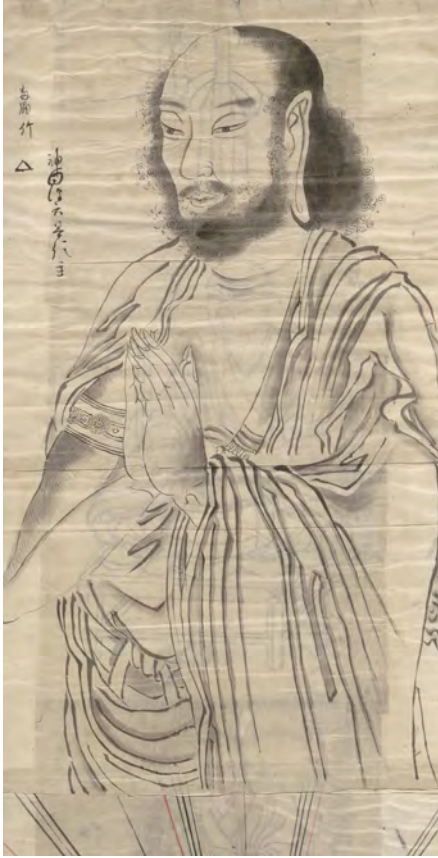
FIGURE 7. Shussan Shaka (detail). Artist unknown. Possibly late Edo period. Ink on paper. © Ethnographic Museum at the University of Zurich. Inv. no. 32617. Photo: Kathrin Leuenberger.

There are also drawings that employ shading, resulting in a completely different style than the standard hakubyō with little or no shading. This technique was applied on rock pedestals and the realistic nuances of body contours, thus imparting a three-dimensional quality. Examples are drawings of Shussan Shaka 出山釈迦 (part of inv. no. 32617, FIGURE 7), Kōbō Daishi Kūkai 弘法大師空海 (Inv. no. 32407), and a Fudō Myōō triad entitled Naritasan 成田山 (Inv. no. 32620) referring to the temple Naritasan Shinshōji 成田山新勝寺 central to the Fudō cult. Furthermore, one small drawing of Nichiren Shōnin 日蓮上人, founder of the Nichiren school, bearing the signature and seal of Tan'yū Morinobu 探幽守信 (Kanō Tan'yū; inv. no. 32411, FIGURES 8a and 8b), indicates a closer collaboration between the court painters Kanō and the Kanda atelier if authenticated. These drawings serve as further evidence that the Auchli hakubyō group derived from an atelier that was close to the government (TOCHIGI KENRITSU HAKUBUTSUKAN 1994, 103).