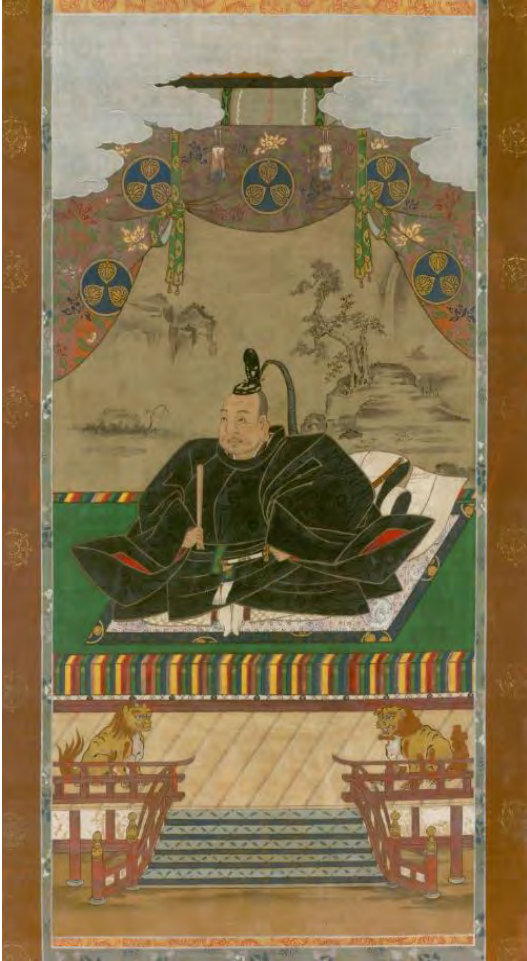
FIGURE 1. Tōshō Daigongen. Inscription by Kanda Sōtei Sadanobu (1765–1800). Edo period. Ink, colors, and gold on silk with painted mount. Saikōin, Saitama Prefecture.

which is the oldest known Kanda Sōtei painting. Notwithstanding the icon order in 1632 mentioned in the Tōeizan nikki , it is likely that the studio's career truly took off a few years later in the mid-1630s with the construction boom at Nikkō (NAKAGAWA 2002, 90).