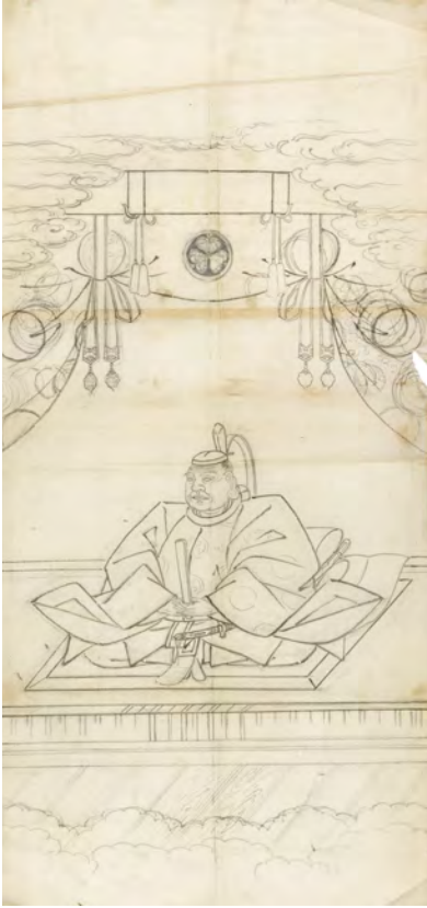
FIGURE 10. Tōshō Daigongen. Artist unknown. Possibly Edo period. Ink on paper. © Ethnographic Museum at the University of Zurich. Inv. no. 32392. Photo: Kathrin Leuenberger.

that counted Ieyasu among its patrons, making it a sensible candidate to order a patriarchal icon with classical iconography from the Kanda atelier. A smaller ink painting of Myōken Bosatsu 妙見菩薩 of Hokutosan Myōkenji 北斗山妙見寺 (Inv. no. 32535) is linked to the Tokugawa in a similar fashion, as Ieyasu bestowed the name Myōkenji on the temple in 1592. The Bosatsu-type iconography of Myōken, the deified image of the North Star, simultaneously indicates a connection to Tendai Onjōji 園城寺, whose doctrine had established Kannon Bosatsu as the honji 本地 (source) of Myōken since the medieval period.