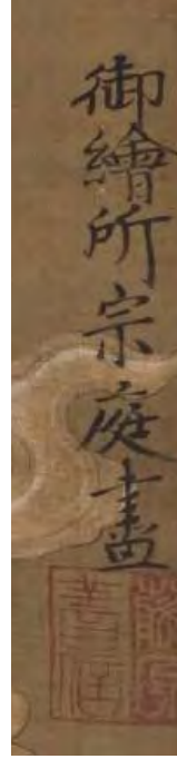
FIGURE 2b. Detail.

icons, but rather enjoyed the exclusive right. This is also apparent from their signatures, where one finds everything from a simple “atelier Kanda Sōtei” to the inclusion of the artist’s full name such as Kanda Sōtei Fujiwara Yoshinobu. The Nitten 日天 (FIGURES 2a and 2b) at the Linden Museum, for example, is signed “a painting drawn by the Sōtei” ( on edokoro Sōtei ga 御繪所宗庭画), and bears the official seal of Fujiwara Yoshinobu (Sōtei III), which leaves little doubt of it being an official Kanda work. Another notable aspect of this scroll is that it clearly depicts a Nitten, even though it has the annotation Dainichi Nyorai written in ink on the reverse. 12