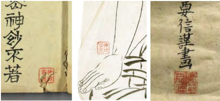
FIGURE 6. Comparison of three seals (detail). L to R: Daihi darani genjō . Inv. no. bunko 06 02235, © Waseda University Library; Shaka Nyorai. Inv. no. 32452, © Ethnographic Museum at the University of Zurich. Photo: Kathrin Leuenberger; Takeda Shingen, see FIGURE 4.