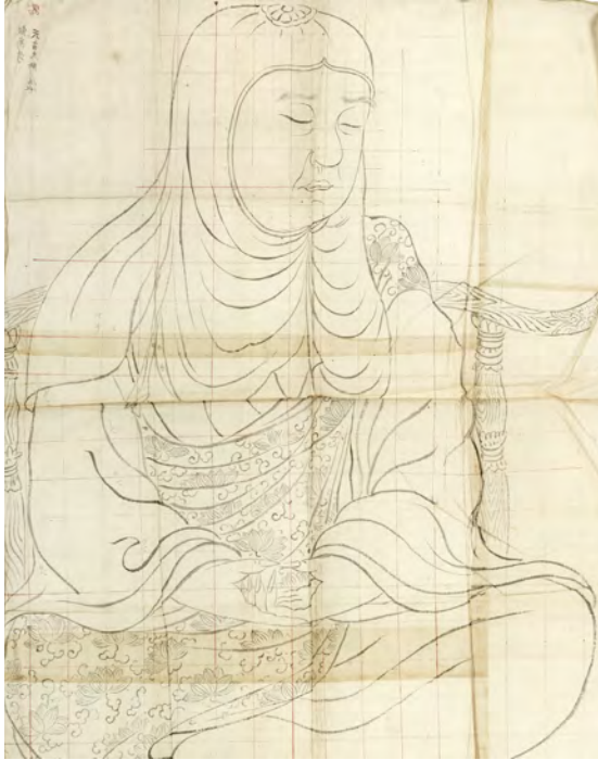
FIGURE 11. Tendai Daishi. Artist unknown. Possibly Edo period. Ink on paper. Inv. no. 32424.

of the Tokugawa, which makes access to the services of the Kan'eiji atelier of Kanda quite probable. There are two other clearly identifiable Pure Land subjects. The first is a complete hakubyō depicting the dream encounter of Hōnen 法然 (1133–1212), the Japanese Pure Land school founder, with his Chinese counterpart Shandao 善導 (613–681), called the Niso taimen 二祖対面 (Inv. no. 32426, held by VMZ). The second is an individual portrait of Hōnen.