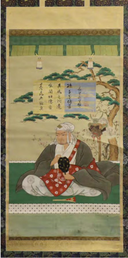
FIGURE 4. Takeda Shingen. Kanda Sōtei Mochinobu (1825–1874). Edo period. Ink, colors, and gold on silk with painted mount. British Museum © The Trustees of the British Museum.

paintings by the Kanda atelier in Europe. An analysis of the Auchli group provides evidence that these objects belong to the output of the Kanda atelier. In this section I reflect on the consequences this discovery has for evaluating the significance of their works in terms of cultural history. 19