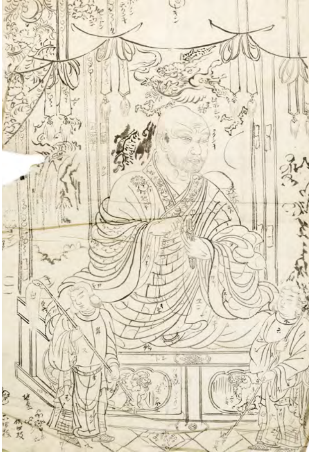
FIGURE 9. Jie Daishi Ryōgen. Artist unknown. Possibly Edo period. Ink on paper. Inv. no. 32470.

such as a partial drawing of the Jūroku Zenshin 十六善神 (Inv. no. 32442, held by VMZ) and several devas such as the aforementioned Ishanaten.