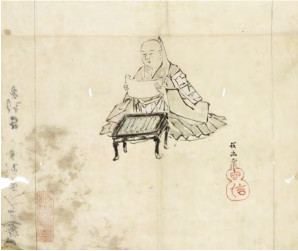
FIGURE 8a. Nichiren Shōnin. Signed Tan'yū with seal of Morinobu, possibly Kanō Tan'yū Morinobu (1602–1674). Ink and colors on paper. Possibly mid-Edo period. Inv. no. 32411.