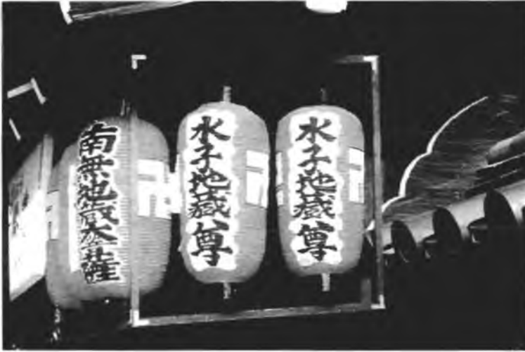
Mizuko Jizō lanterns