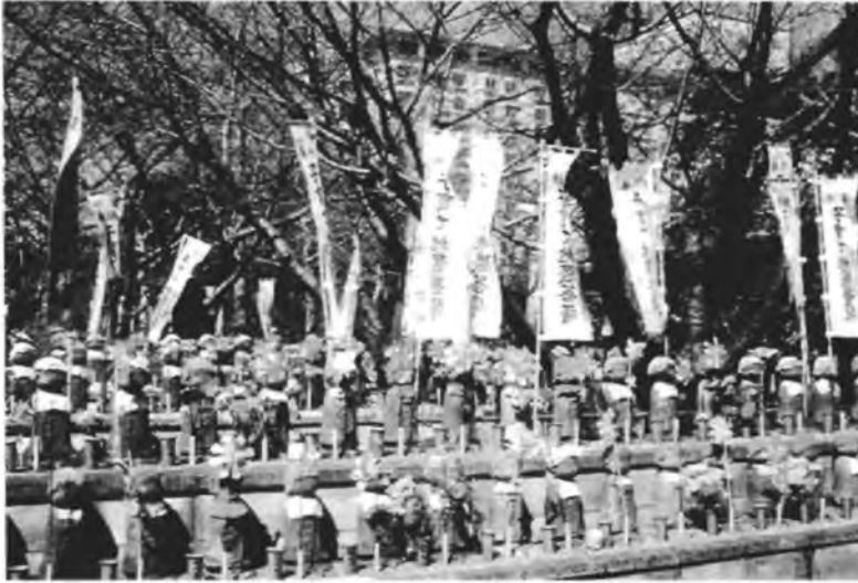
Kosodate Jizō at Zōjō-ji

ceased to erect new statues (without, however, discontinuing the profitable kuyō services). Even the forest of Kosodate Jizō (see below) banners, so characteristic of the Zōjō-ji landscape, has disappeared. (I have been given different reasons for this by different Zōjō-ji priests.) Fortunately the present writer had taken a sufficient number of photographs before the recent “deforestation.”