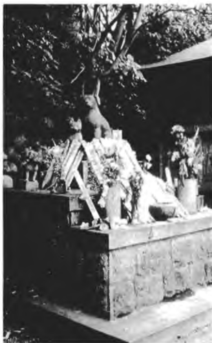
A corner for petto-kuyō

As regards the oft-invoked Shinshū opposition to abortion, it should