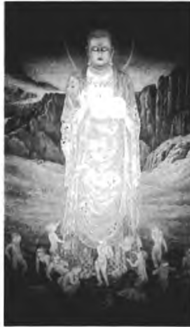
Temple painting of Mizuko Jizō