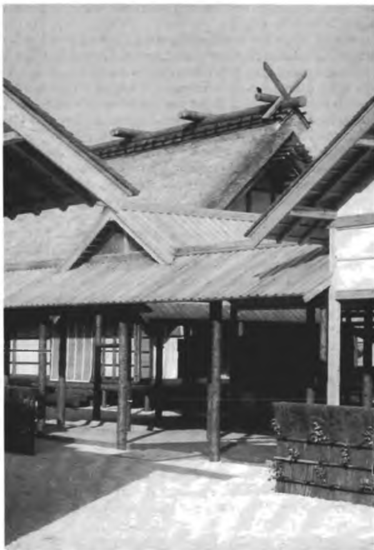
Plate 2. The Sukiden