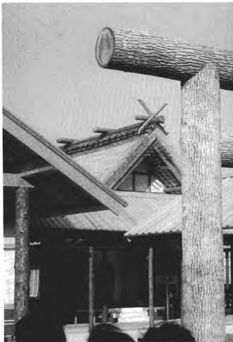
Plate 1. The Yukiden