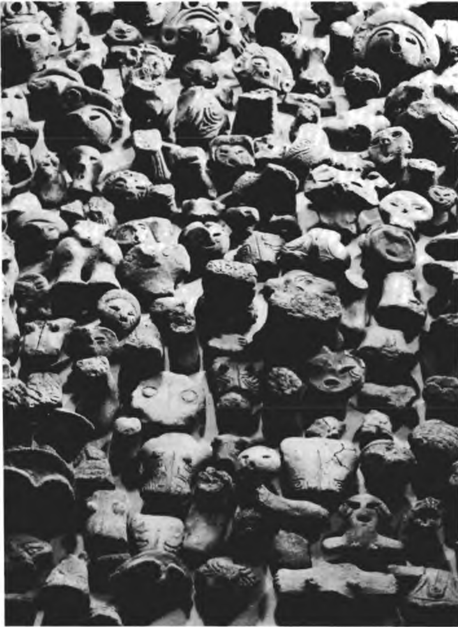
Plate 1: Clay Figurines from Shakadō