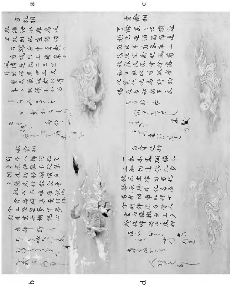
Figure 7. Detail of kusōzu , (a) aspect of putridness; (b) aspect of being consumed; (c) aspect of blueness; (d) aspect of white bones linked.