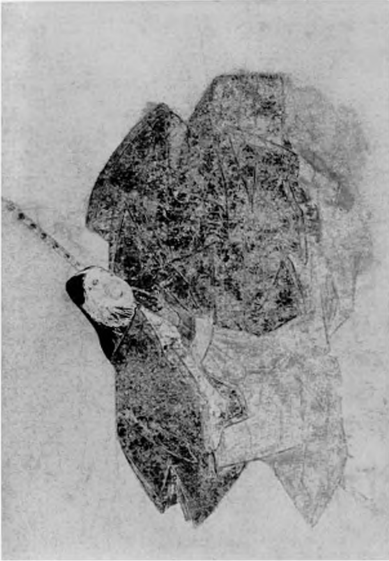
Figure 11. Detail of woman in life, in the Nakamura family collection. (Komatsu Shigemi, ed., Gaki zōshi, jigoku zōshi, yamai sōshi, kusōshi emaki , vol. 7, Nihon emaki taisei [Tokyo: Chūō Kōronsha, 1977], p. 110)