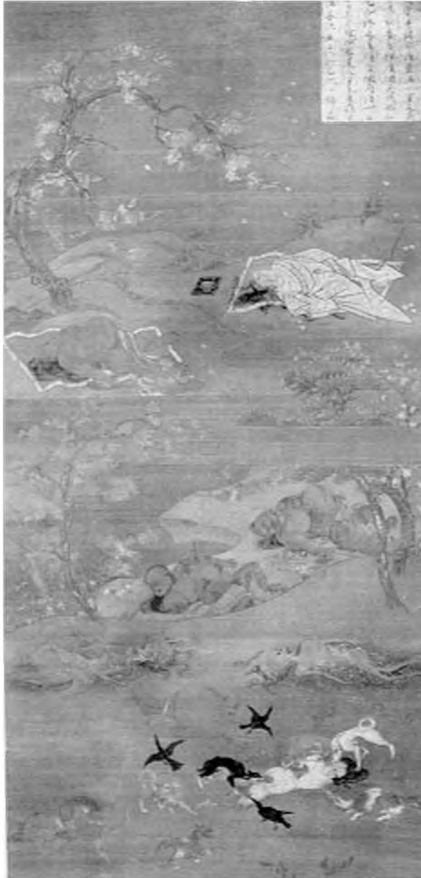
Figure 1. Jindō fujō sōzu , Shōjuraikō-ji, Shiga Prefecture, early thirteenth century. (Sherman Lee, Reflections of Reality in Japanese Art [Cleveland: Cleveland Art Museum, 1983], Color Plate II. The Realm of the Humans.)