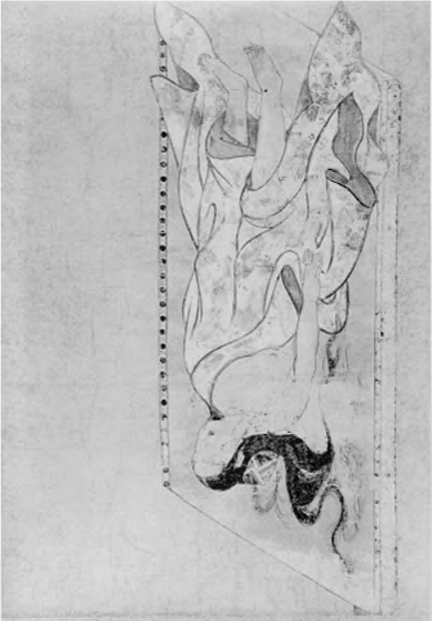
Figure 9. Detail of kusōzu , cadaver with breast showing. (Komatsu Shigemi, ed., Gaki zōshi, jigoku zōshi, yamai sōshi, kusōshi emaki , vol. 7, Nihon emaki taisei [Tokyo: Chūō Kōronsha, 1977], p. 111)