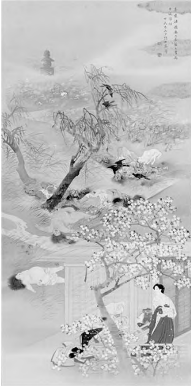
Figure 5. The Inevitable Change , Kikuchi Yōsai (1788–1878), William Sturgis Bigelow Collection, Museum of Fine Arts, Boston.