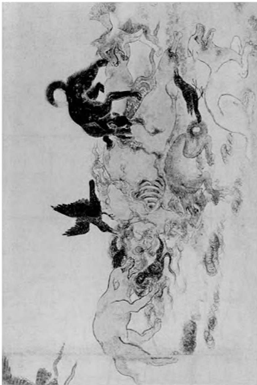
Figure 2. Kusōzu , private collection, fourteenth century. (Komatsu Shigemi, ed., Gaki zōshi, jigoku zōshi, yamai sōshi, kusōshi emaki , vol. 7, Nihon emaki taisei [Tokyo: Chūō Kōronsha, 1977], p. 113)