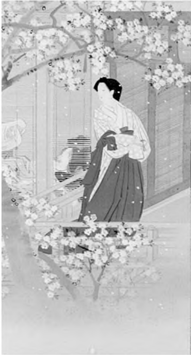
Figure 10. Detail of The Inevitable Change .