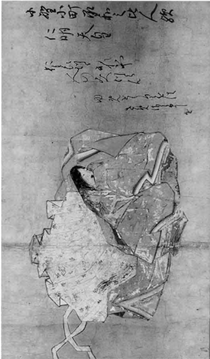
Figure 12. Portrait of Ono no Komachi by an unknown artist in Sanjū rokkasen emaki , of the late 16th century (Spencer Japanese MS 28).