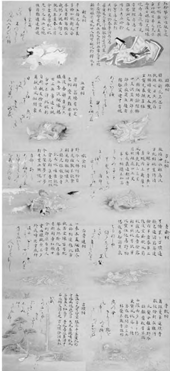
Figure 3. Kusōzu , Los Angeles County Museum of Art, Anonymous Promised Gift, eighteenth century.