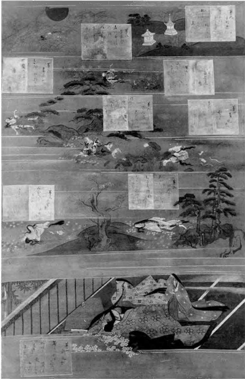
Figure 4. Jindō fujō sōzu , Fred and Isabel Pollard collection, Art Gallery of Greater Victoria, eighteenth century.