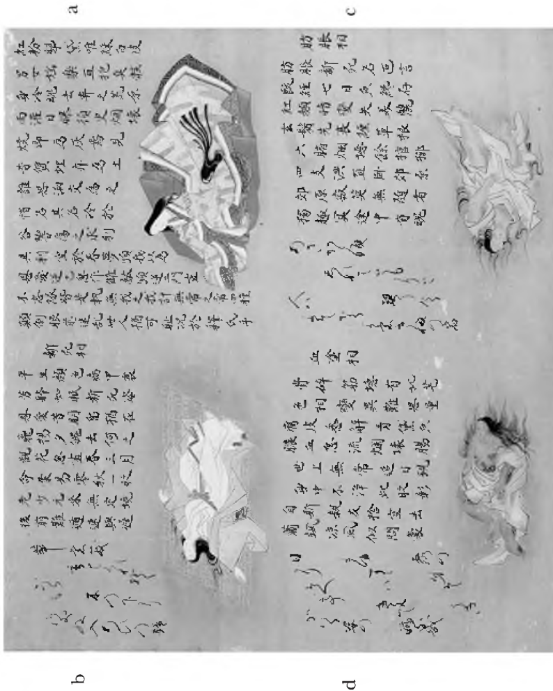
Figure 6. Detail of kusôzu , (a) life; (b) aspect of recent death; (c) aspect of bloating; (d) aspect of blood oozing.