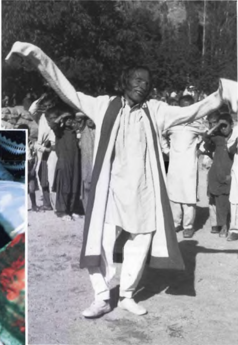
FIGURE 3. Smiling bitan beckons the mountain spirits to descend.