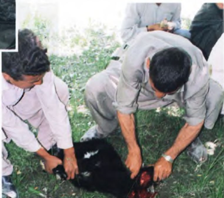
FIGURE 5. Chato for the oracle.