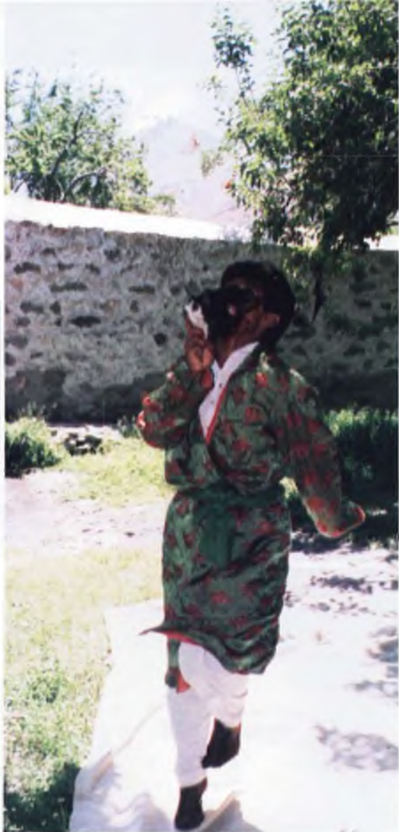
FIGURE 6. Drinking blood from the goat's head.