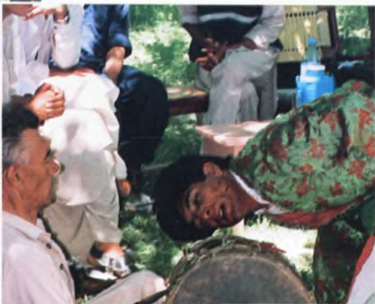
FIGURE 8. Blood-smeared shaman receiving pari messages emanating from the drum.