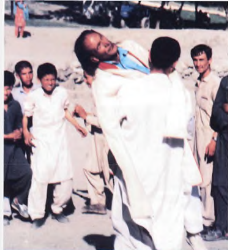
FIGURE 9. The bitan collapses suddenly and is carried off by attendant.