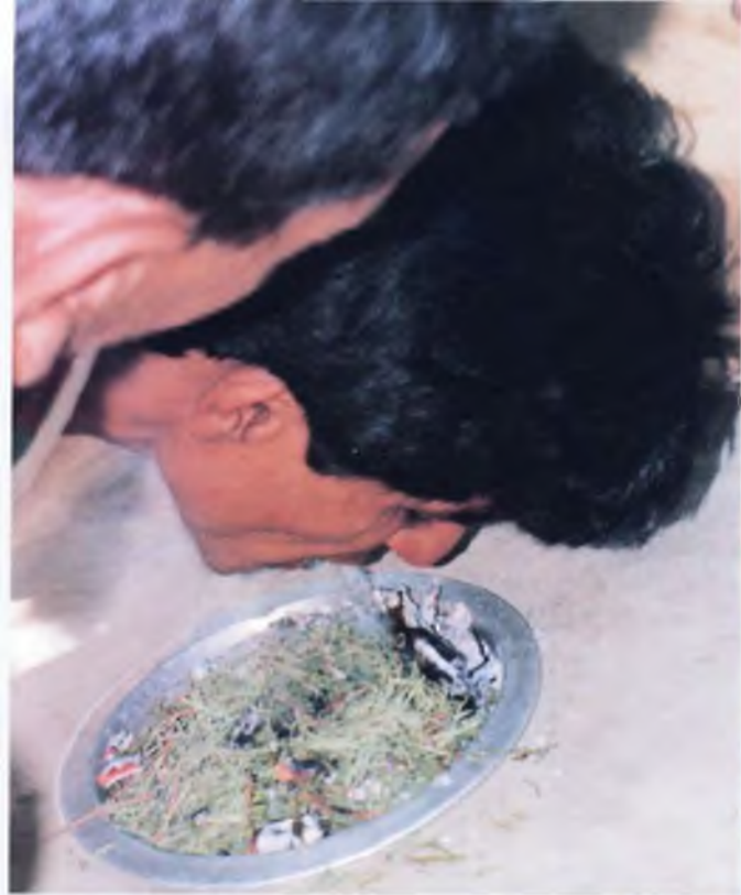
FIGURE 1. Bitan forced to inhale burning juniper leaves.